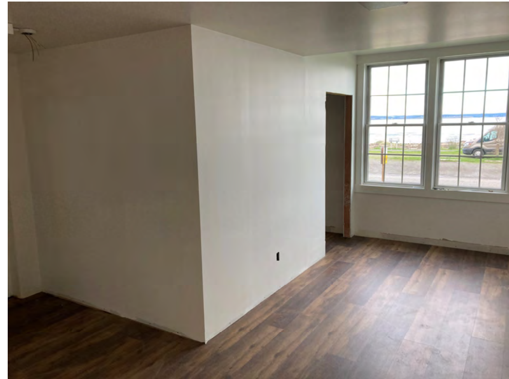
Looking toward Storage Room