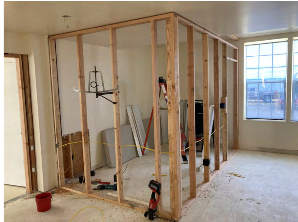
Framing and rough electrical for Storage Room.